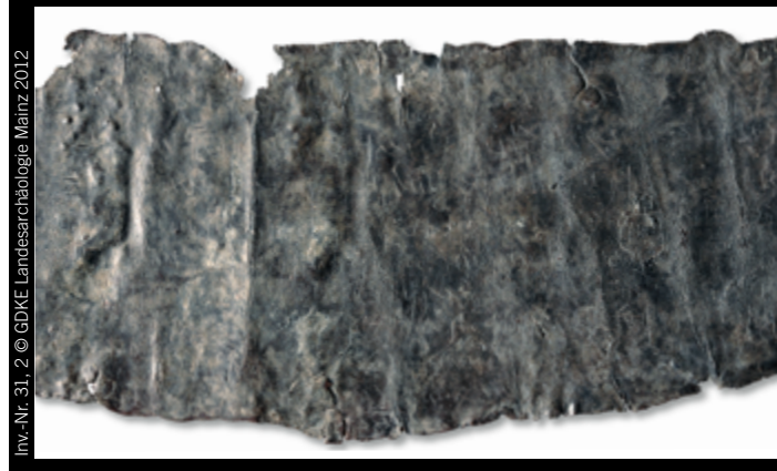
Inv.-Nr. 31, 2