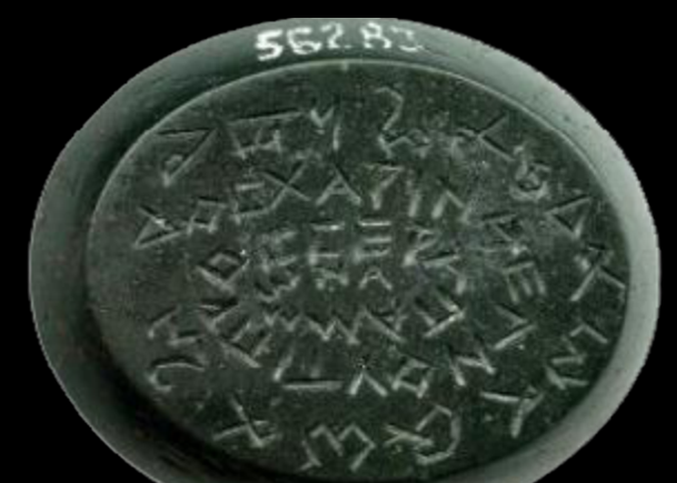
Gemme GB-BM-MMEU, G 283, EA 56283