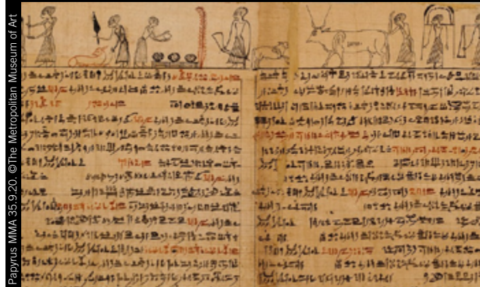
Papyrus MMA 35.9.20.