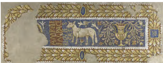
© Museu Nacional Arqueològic de Tarragona